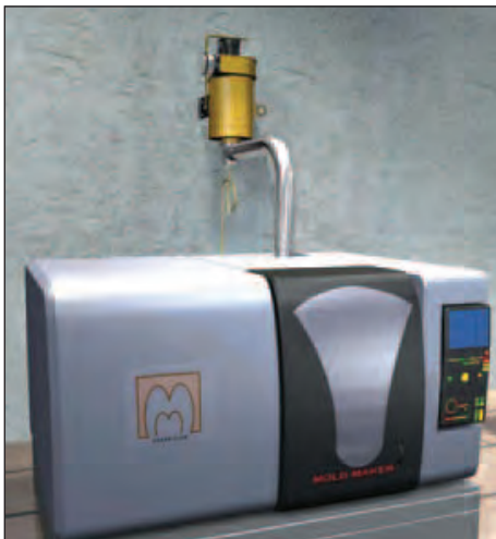
Wall mount – recycled